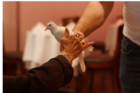
This dove flew out of an empty hat!