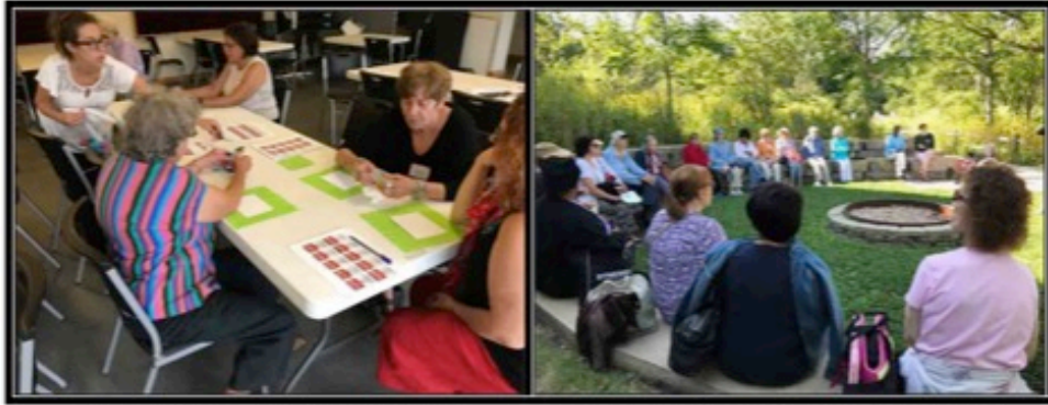
The Art of Aging Project at a Drop-In